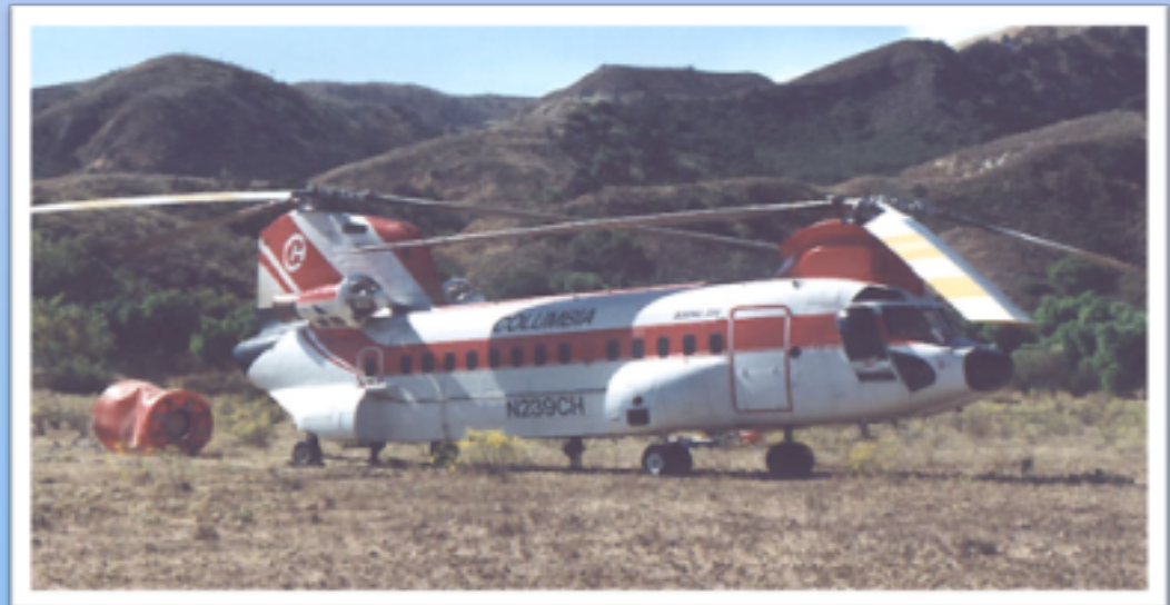
Boeing 234 Vertol Chinooks