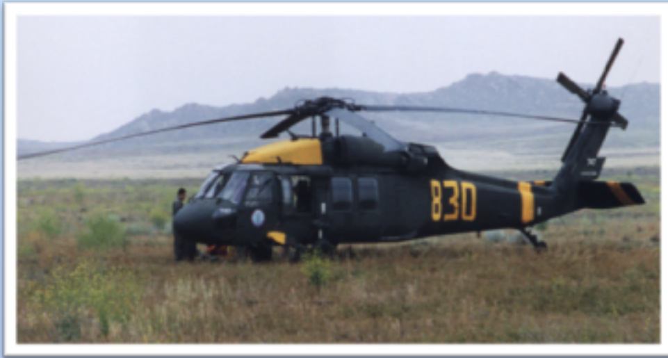
UH-60 Black Hawk