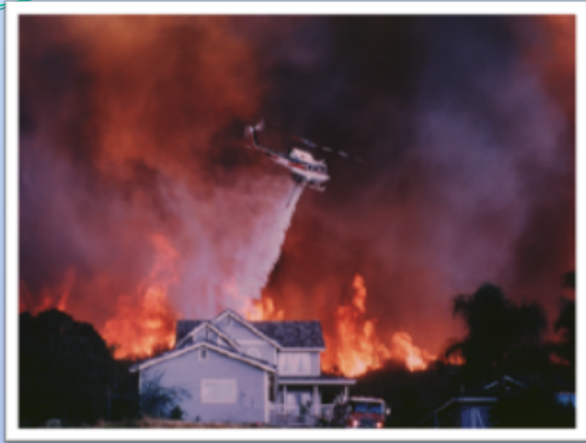
Bell-212 w/ tank