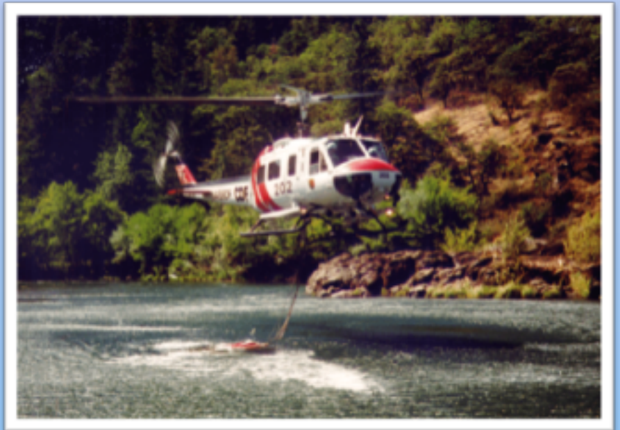
Bell-UH1H CDF-Super Huey w/ bucket